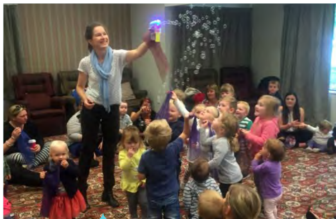
Music and Movement every Thursday morning at Wallingford Home in Temuka.

Every Thursday morning a growing group of Wallingford residents look forward to joining a colourful musical melee as the Temuka Plunket “Music & Movement” group welcomes caregivers with their babies and toddlers to join in a varied and action packed hour of fun. The programme weaves together sounds, actions and colours using musical instruments and aids such as shakers, coloured scarves, balls and bubble makers.