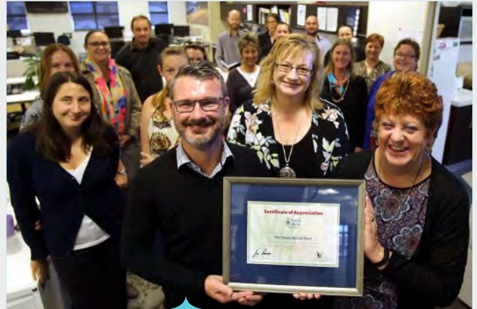
Timaru Herald Staff accept their certificate of thanks.

Support from these and many other local organisations is very much appreciated. Without this and our regular donor support, calls for help from many in our local community would simply not be able to be answered.