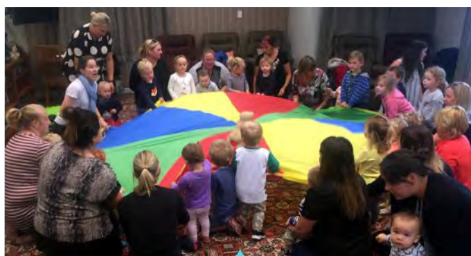
Music and Movement every Thursday morning at Wallingford Home in Temuka.