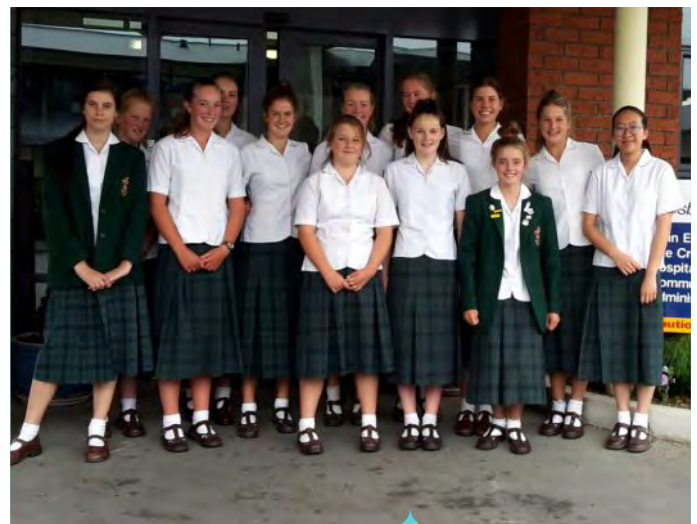
Craighead students volunteer regularly at PSSC.

"Listening to other people's stories made me think a bit more about mine."