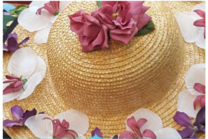
Floral creation by Lorraine.

Easter eggs), In the Bush (bark, butterflies, feathers and moss) and RN (Registered Nurse - complete with medication containers, button pills and medical gloves).