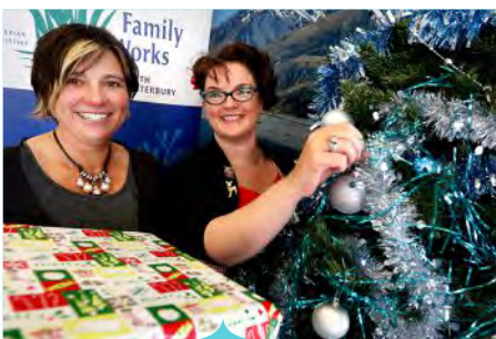
The Family Works team were kept busy with gifts left under the community Christmas tree at the Timaru Herald.

Gifts and foodbank resources were also shared with other organisations including Family Support, St Vincent de Paul and the Public Health Nursing Service team.