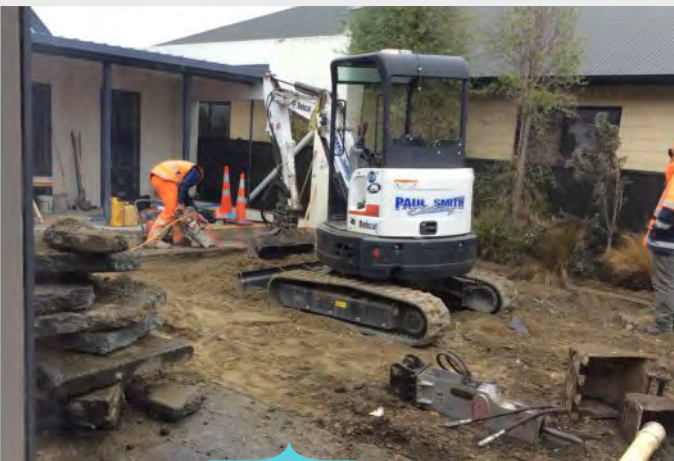
Excavation begins for the new Family Works meeting rooms.

A new safe play area for children will help families accessing services. The play area will also be well utilised when “The Incredible Years” parenting programmes are held.