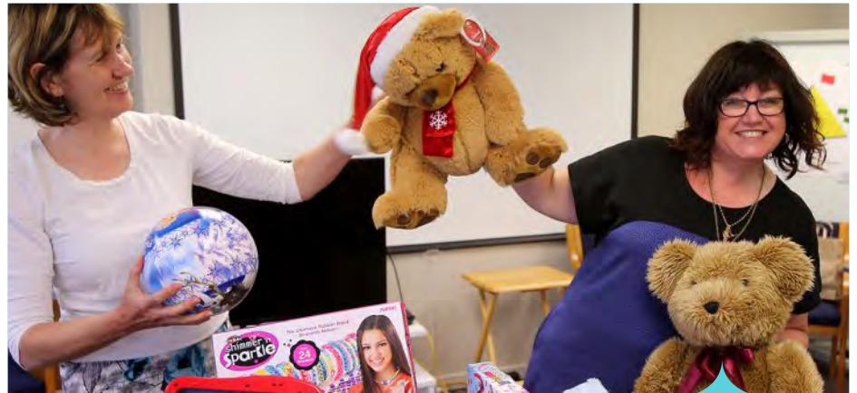
Wrapping presents for local families.