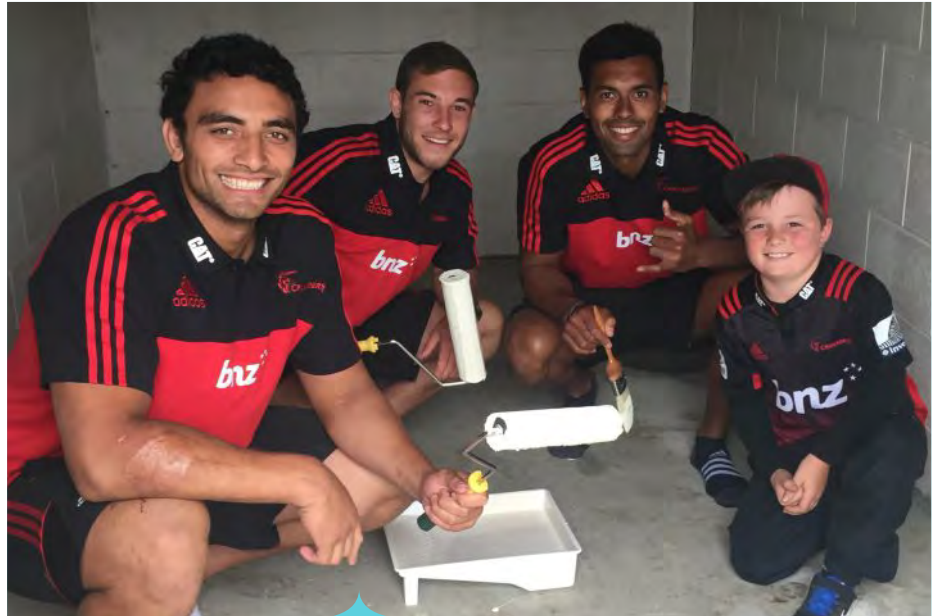
The Crusaders Super Rugby team put their DIY skills to good use at the Enliven Day Centre.

Designed specifically for clients diagnosed with dementia, our Saturday Club day activity programme, also run at the new Enliven Centre, is operated by qualified and experienced staff.