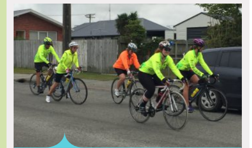
Riders heading off towards Kurow after their Waimate break stop