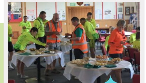
Hungry riders tuck into a sustaining morning tea provided by PSSC for their Waimate break

For more information about the toddler programme or others in "The Incredible Years" series of parenting programmes, visit www.pssc.org.nz/family-works or call 03 688 5029.