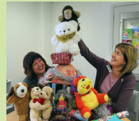
Family Works "Elves" prepare to distribute gifts

families and whānau. Thank you for making a difference!