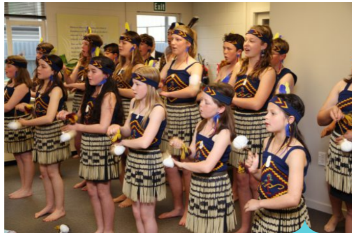
The Bluestone School Kapahaka Group delighted guests with their performance at the PSSC 2016 AGM at Family Works

The opening celebrations at our 2016 AGM in October were shared by many supporters, staff, friends and colleagues from other social service agencies. Providing new counselling areas and rooms for family work, the extension, supported by a grant from the Community Trust of Mid & South Canterbury, has made it much easier for us to meet our increasing workload with vulnerable children and families. The new safe children's play area is well used when "The Incredible Years" parenting programmes are being held and is also a fantastic space for younger family members to enjoy while parents are working with Family Works social workers and counsellors.