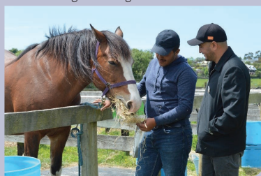
Volunteering at Riding for the Disabled

The RSS team are part of our Family Works team located at 3 Sophia Street Timaru.