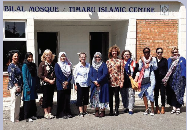
Refugee Settlement Services team (and others) viewing recently renovations at the Bilal Mosque, Timaru Islamic Centre.

We continue to support two families from Syria who arrived to Timaru in June 2020. Since arriving they have been attending English classes, settling into kindergarten, primary and high school. They speak Arabic, and for many now also English. They have been learning about New Zealand culture and experiencing the diversity of activities that we have available to us in Timaru (swimming, fishing, cycling, playgrounds, arts & crafts and more). They have joined in several cultural events with Multicultural Aoraki. They have made friends, which have led onto job opportunities, along with volunteer