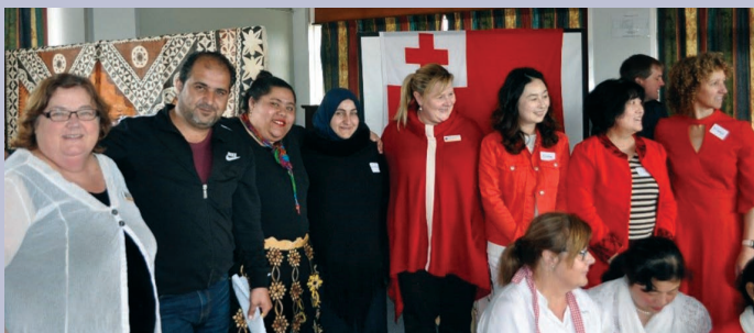
Celebrating Tongan day with Multicultural Aoraki

There have been lots of smiles, as well as many challenges and opportunities for future learning. The settlement journey for former refugees is not a straightforward road.